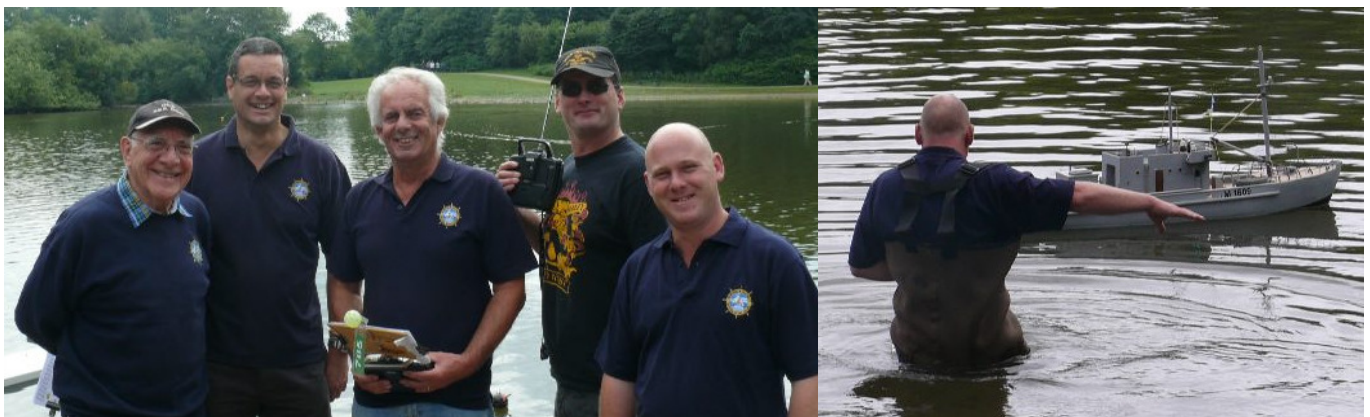
The winning team!