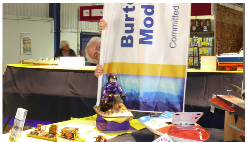
It was also reported that Branston man put in an appearance at the show. Elusive and shy as ever, he was spotted in the cafeteria every couple of hours.